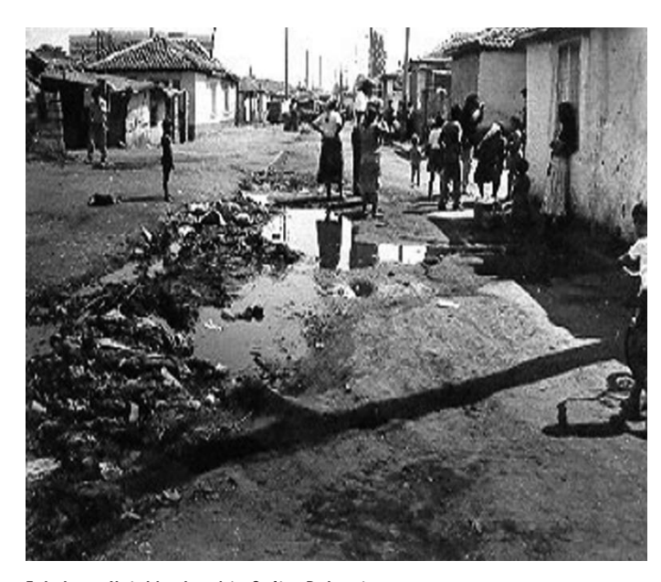
Fakulteta Neighborhood in Sofia, Bulgaria.

The Fakulteta Roma Settlement in Sofia, the capitol of Bulgaria, is home to over 35,000 Roma people. It is not far away from the city centre. The first Roma families bought land and settled there in the 1930s,<sup>101</sup> and ever since, Fakulteta has a growing number of inhabitants turning into an