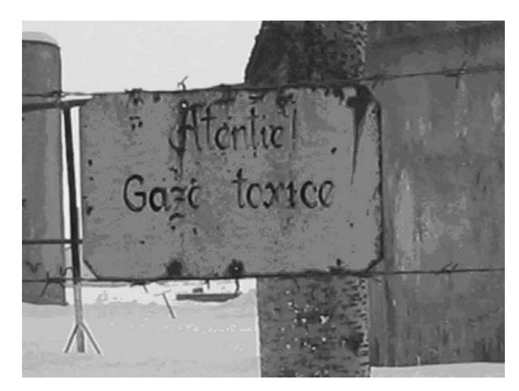
Miercurea Ciuc, Romania.

In Piatra Neamt, again Roma were transferred to the periphery of the city into a precarious environmental living situation near a garbage dump and shooting grounds. In Salaj Silmeul Silvaniei, the Roma live in environmental risky conditions where there is no access to water, heat, or sewerage. In Episcopia Bihor, a Roma settlement was built on the municipal rubbish dump of Oradea. Most of the Roma in the settlement live off of the recycled garbage. They are exposed to toxic materials and smog and air pollutants from incinerated waste.