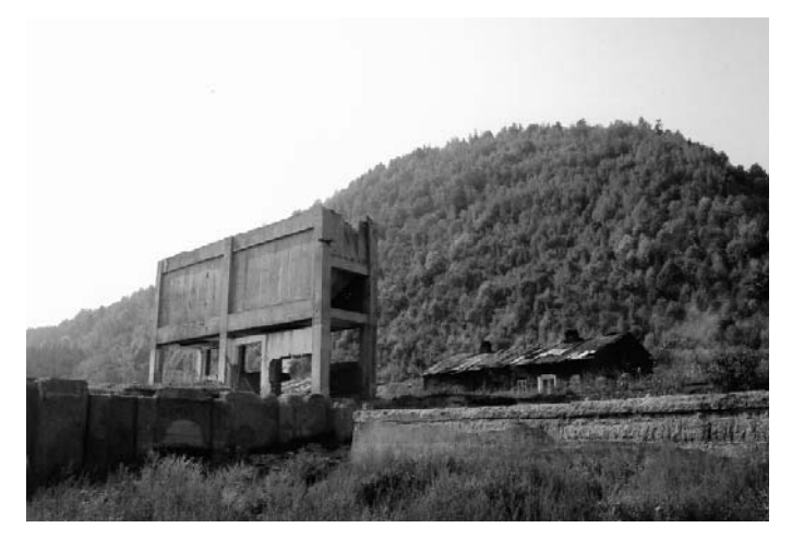
Zabijanec Settlement.

Various trainings and short courses have been organized to help people get better education and find jobs. Those who got job opportunities or whose economic situation improved left the settlement. There is no political will to legalize the settlement, only 'soft' programs were given a green light from the city authorities. Because of the insecurity, houses are not been repaired and the land ownership issue is still not clear.