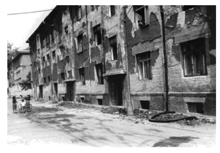
Ostrava, Czech Republic.

HISTORY AND EVOLUTION OF THE CASE: Ostrava is considered to have one of the largest populations of Roma in the Czech Republic. In 1993 when the Czech Republic was established, Roma were denied citizenship status through a new Citizenship Act.<sup>82</sup> The Roma took residence in the neighborhood Slezska Ostrava of Hrusov when the middle class residents moved out into better apartments in 1950-70. In 1980 a highway overpass was built and in the summer of 1997, the place was severely flooded. Some of the inhabitants were relocated to emergency housing, while some residents stayed. The Main Office of the Architect of the City of Ostrava declared the place uninhabitable and a local government decision declared the area unsuitable for housing due to the constant threat of flooding. Despite the conditions, 70 families still reside in the area with the approval of the Slezska Ostrava municipal authorities.