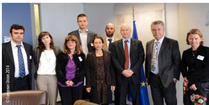
Green 10 representatives including HEAL present their position on TTIP to EU Commissioner for Trade, Karel de Gucht (second from right).

The Green10 is a group of the ten leading environmental organisations active at EU level. As a member, HEAL values working with these organisations to gather expertise and produce sound evidence, and to multiply the impact of our efforts. Exchanges with top level EU Commission officials such as the EU Commissioner for Environment Janez Potočnik have helped to raise HEAL's profile and ensured health considerations were taken up in horizontal EU policy deliberations. This was particularly impactful during the Irish EU Presidency and the agreement on the 7th EU Environmental Action Programme (EAP).