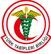
Turkish Medical Association

PUBLISHED February 2015 with endorsements from the following Turkish medical associations: