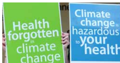
HEAL posters at the UNFCCC global climate talks

HEAL was one of several groups that co-organised the first “Health Summit” in Durban. Attended by hundreds of participants, including representatives from the World Health Organization, it provided an opportunity to distribute our new postcard and display posters featuring the findings of the Acting NOW report and helped build the international health and climate voice.