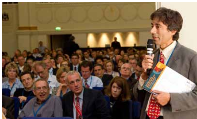
Three hundred medical and military experts asked the EU to move to a 30% target on climate change. Many more signed on to the conference statement.

A HEAL delegation to Poland was received by government officials in Warsaw and addressed a major conference in Poznan attended by representatives from the Ministry of Health and many