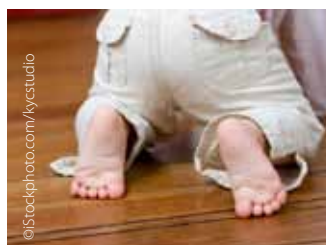
Babies are first to be exposed to hazardous chemicals on dusty floors found under the bed.

The initiative aimed to raise awareness of concerns related to EDCs and to strongly encourage the European