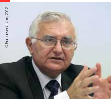
EU Health Commissioner John Dalli emphasised prevention and the “underlying economic, social and environmental factors”.

HEAL was delighted when European Health Commissioner, John Dalli acknowledged “environmental factors” in the European Commission’s address to the United Nations High-level Meeting on Non-communicable diseases in September 2011. Chronic or non-communicable disease, including cancer, respiratory diseases, cardiovascular disease and diabetes, are at least in part caused by environmental